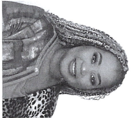
HRH Eurika Mogane Commissioner